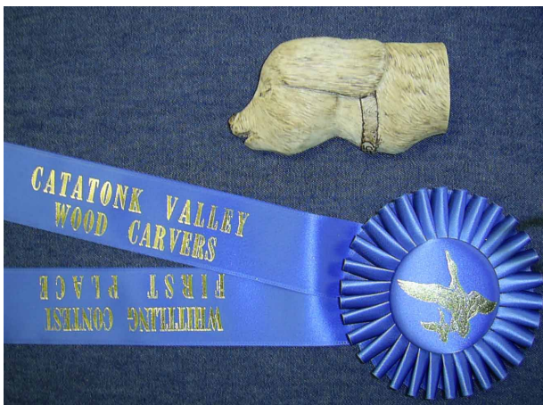
Whittling winner

Pre-sale of raffle tickets was lower this year due to a late start on the sales, but brisk sales during the show, in part, made up for this.